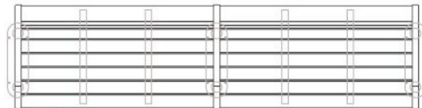
96" Infinity Seat